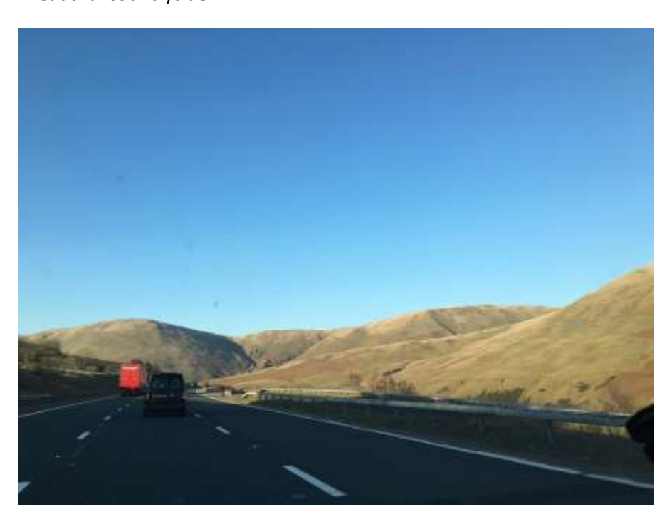
"open road \bigcirc "