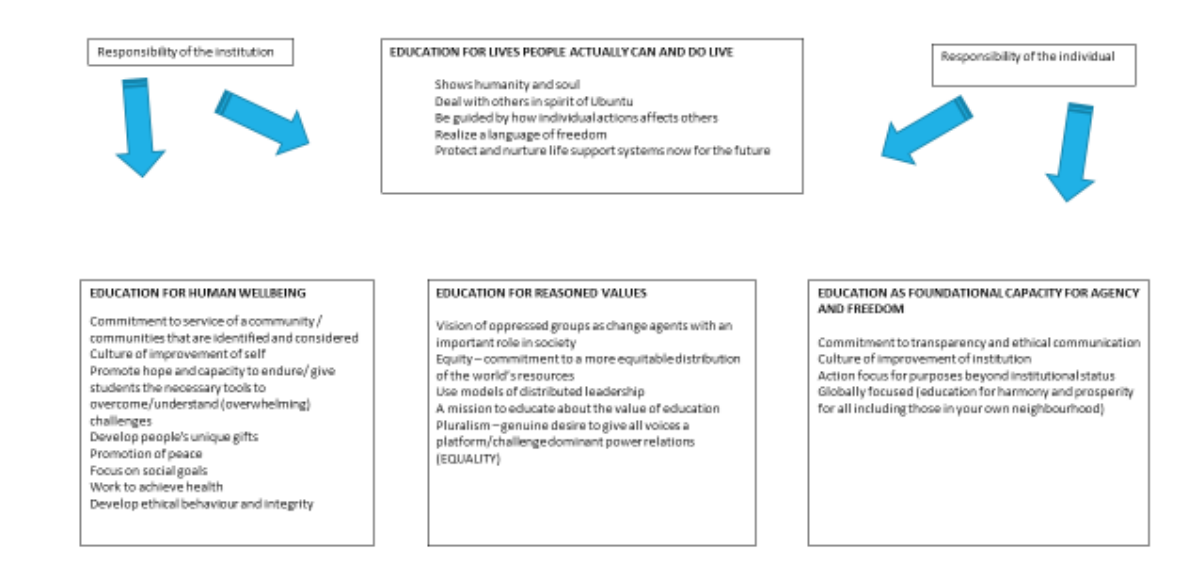
Figure 3. A framework for the development of a university mission statement (English)